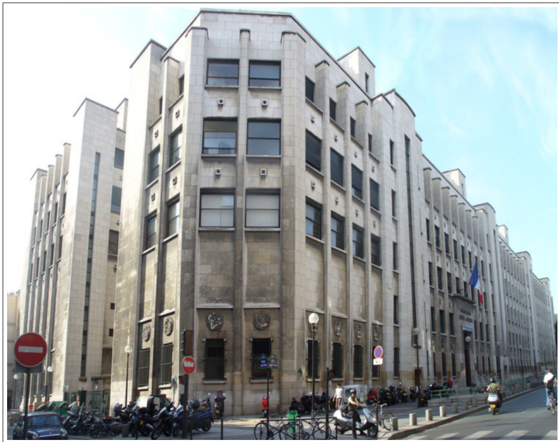
Main entrance is on the right on this picture

The closest Metro station is station Saint-Germain-des-Prés on line 4. Paris metro connections can be found on web page http://www.ratp.fr/ A metro map can be found there: http://www.ratp.info/orienter/plan_metro_pdf.php